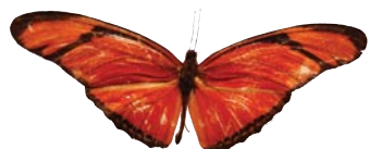
Dryas iulia "Julia"