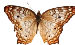
Anarta jatrophae "White Peacock Butterfly"