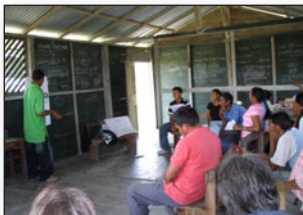
Training session for satellite producers