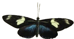
Heliconius doris "Doris longwing"