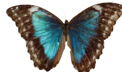
Morpho menelaus menelaus ♀