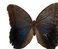
Caligo eurilochus eurilochus ♂