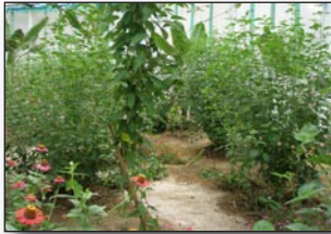
Interior of the Butterfly House