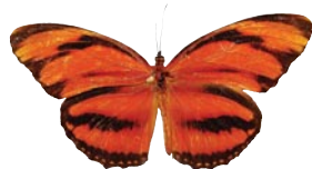
Dryadula phaetusa "Branded Orange"