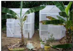
Flight cages for breeding