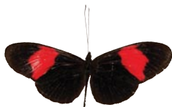
Heliconius erato "Red Passion Flower Butterfly"