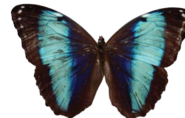
Morpho helenor extremus ♂