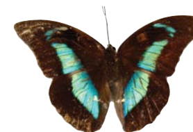
Archaeoprepona demphon "One Spotted Prepona"