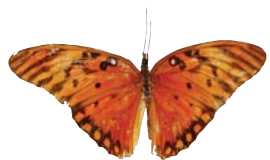
Agraulis vanillae maculosa "Gulf Fritillary"