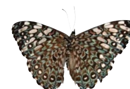
Hamadryas feronia feronia "Red-Spotted Clicker"