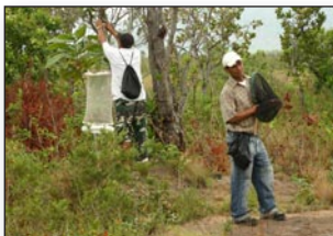
Collecting specimens for identification