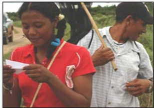
Catching new butterflies